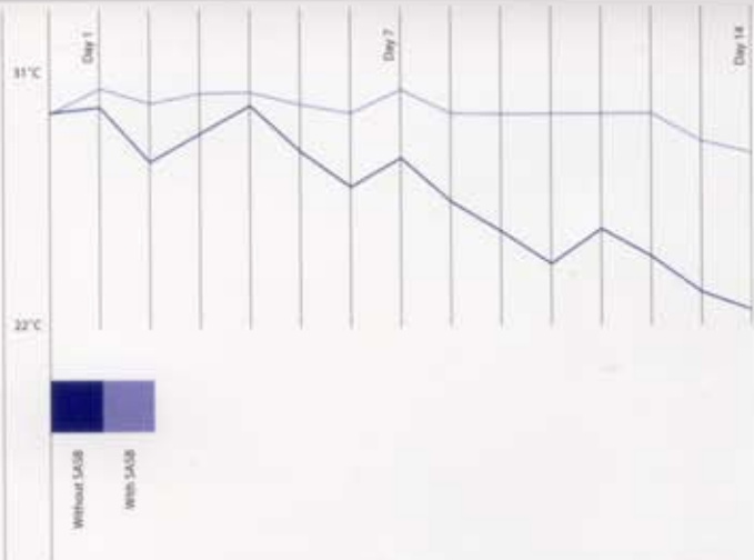
Graph represents two identical pools subjected to the same climatic conditions over a period of 14 days. Both pools are solar heated, with controllers set to 30°C.

On indoor pools the Security Blanket will dramatically reduce evaporation. That in turn reduces condensation and the corrosion it causes.